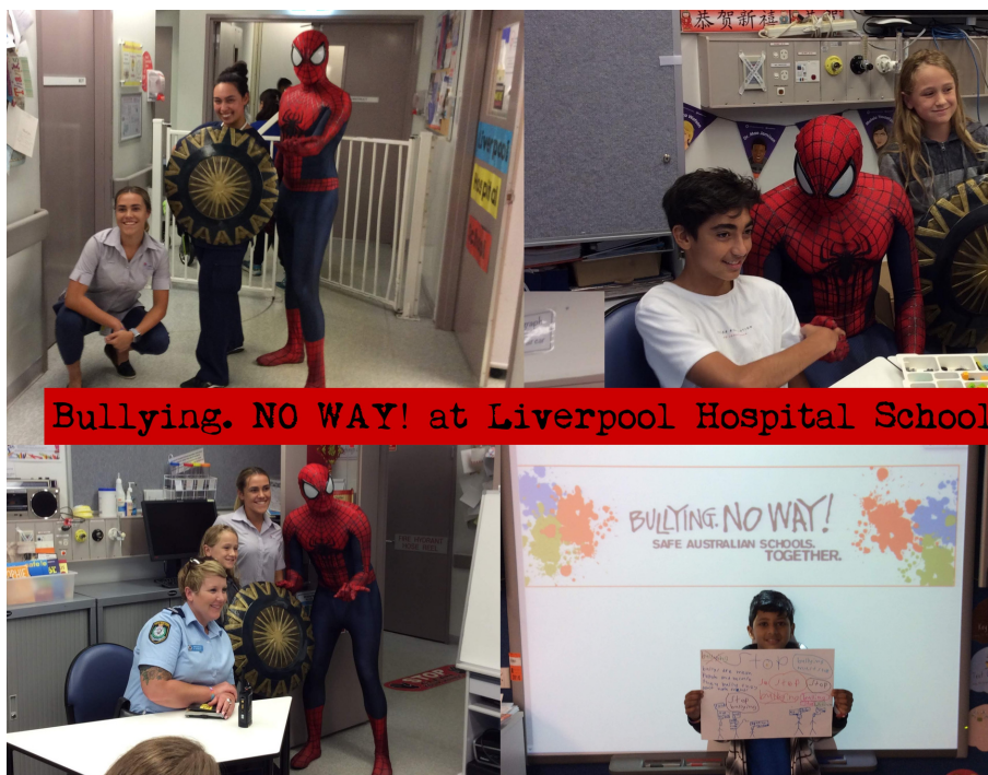
Bullying. NO WAY! at Liverpool Hospital School