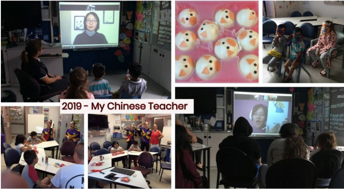
2019 - My Chinese Teacher

Liverpool Hospital School were lucky enough to experience a taste of China and there was no better time to immerse ourselves than during the Lunar New Year!